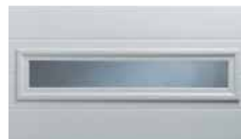
24" X 4" PEXIGLASS