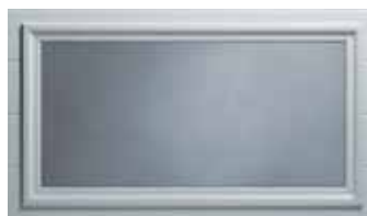
24" X 12" SSB OR INSULATED GLASS