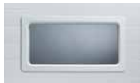
24" X 12" INSULATED GLASS