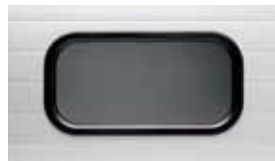
26" x 13" DOUBLE INSULATED ACRYLIC WINDOWS WITH BLACK FRAME