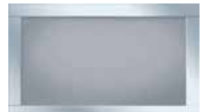
OPTIONAL FULL-VIEW PANEL Clear and Dark Bronze Anodized Aluminum, White Powder Coat, or Custom Powder Coat colors. Not available for 1350.