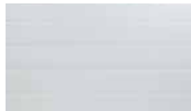
RIBBED PANEL WITH STUCCO EMBOSSMENT 2720 is Flush Panel with stucco embossment.