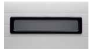
24" x 6" DOUBLE INSULATED ACRYLIC WINDOWS WITH BLACK FRAME