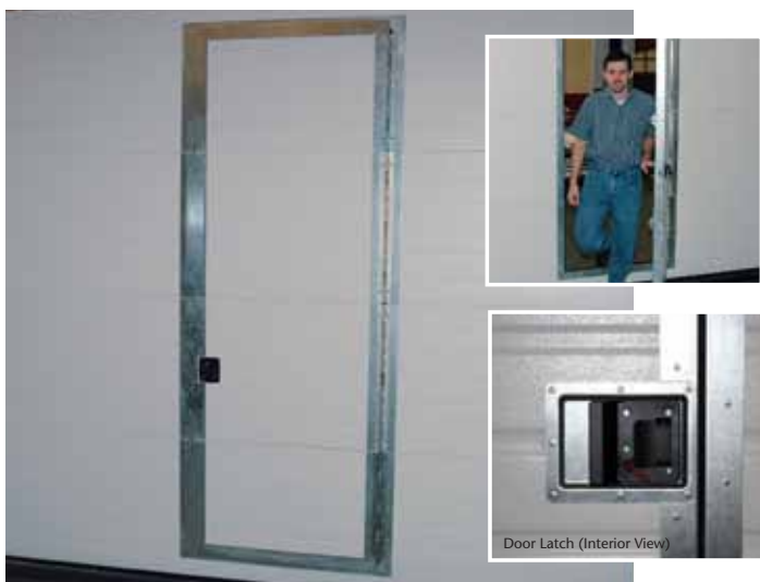
Available for Model 2700 only in door sizes up to 16'2" wide x 16' tall. Wind Load option not available.